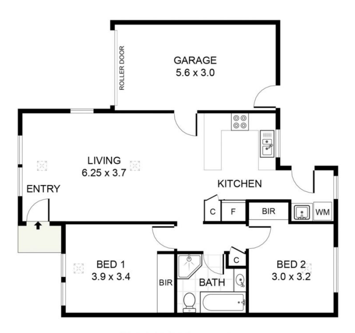
This drawing is for illustrative purposes only. All measurements are approximate. Details to be relied upon should be independently verified.